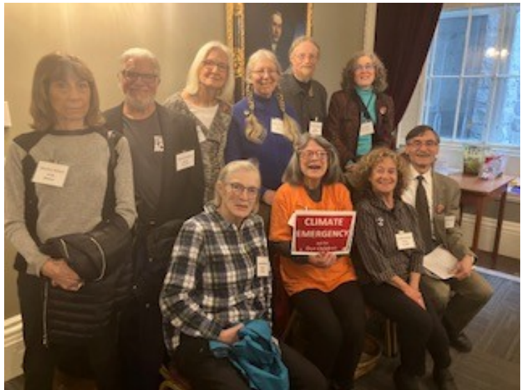
Members of Third Act VT at the April 11 House Government Operations and Military Affairs Committee hearing