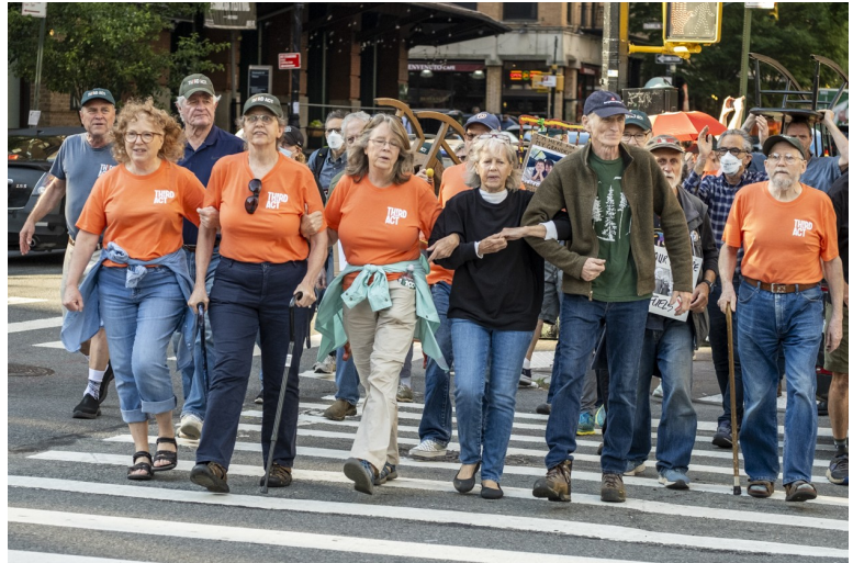
Third Act Vermonters marching in Summer of Heat on Wall Street in New York City, June 2024