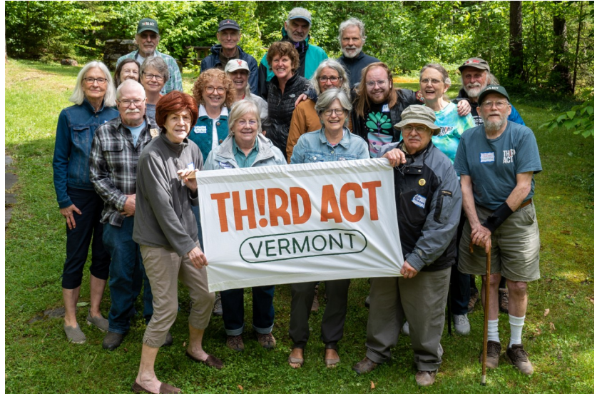
Third Act VT Rendezvous at Allis State Park in Randolph in June

June, 2023: No new co-facilitators had stepped forward. The Coord Com decided to rotate leadership of Coord Com and statewide meetings and not to tackle the other co-facilitator tasks.