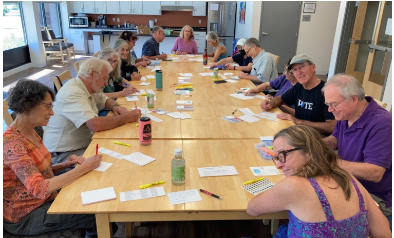
Third Act VTers post-carding at Allard Square in South Burlington